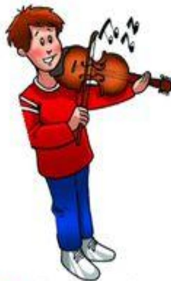
playing the violin